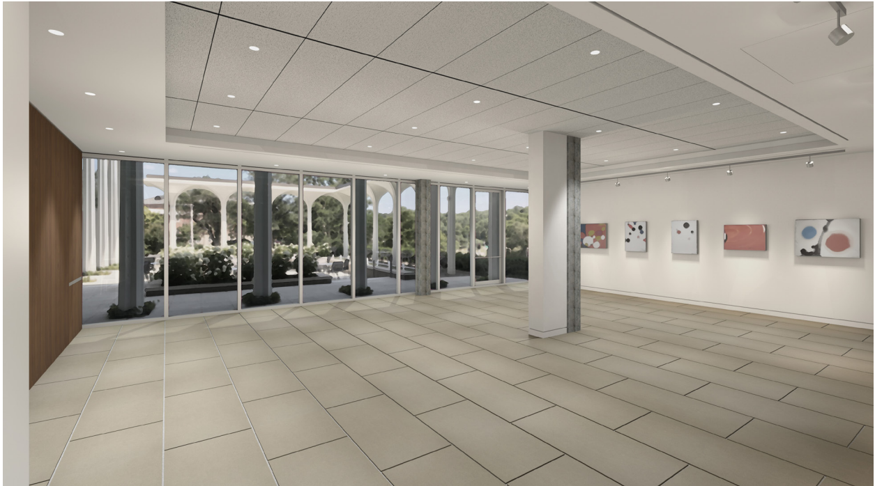
Facing East with Courtyard beyond